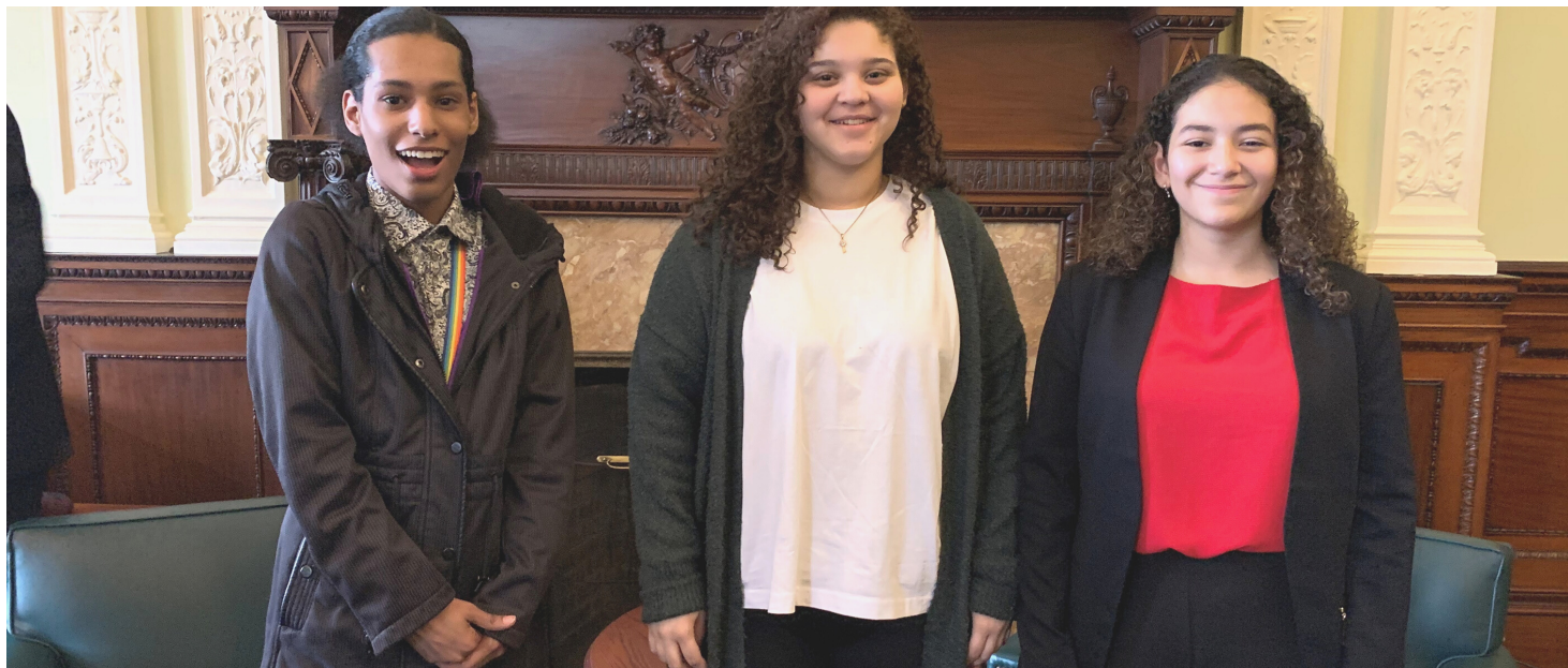
Early College Students at the Early College Briefing Event