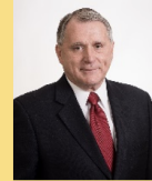
Bill Daggett, Ed.D.

Equity, social justice, Social-Emotional Learning, mental health, and a rigorous and relevant instructional program for all students are recent but critical issues that schools today are required to address. Meanwhile, the demands of the past have not gone away. The brick-and-mortar school model of the last century with the bell schedule, boundaries, rules, regulations, certifications, tenures, contracts, and a hyper-focus on meeting proficiency on high-stakes tests continue to demand attention. While the demands continue to compound, a silver lining is emerging through the hardships brought on by COVID. It has created a tipping point for many educators, policy makers, business leaders, and parents around the immediate need to transform our education system. The pandemic has also taught us that change is possible in the ways we had not imagined even one year ago. Dr. Bill Daggett will share emerging solutions to these challenges.