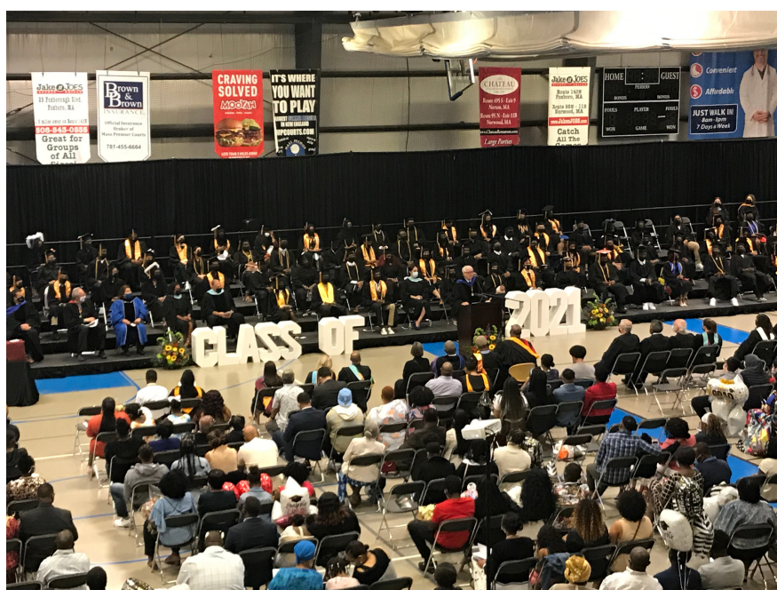
New Heights Charter School's graduation, May 2021

NHSCSB graduates earned at least 12 credits and 51% earned an Associate's degree by the time of their high school graduation.