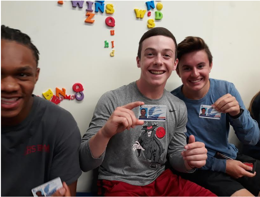
Salem High School