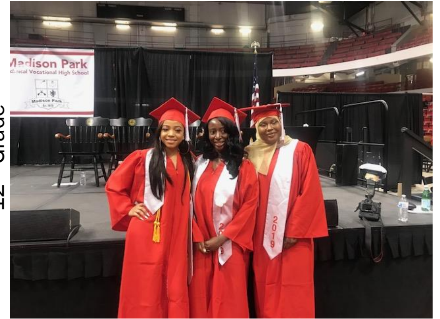
Madison Park High School